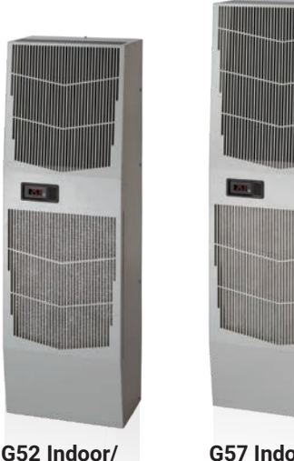
G57 Indoor/ Outdoor 8,000 & 12,000 20,000 BTUs/Hr 5.900 Watts