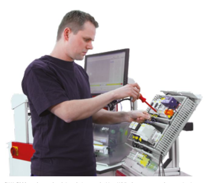
PWA 5000 can be used real-time during panel wiring. While the operator makes terminations, PWA is making the next wire to be installed.