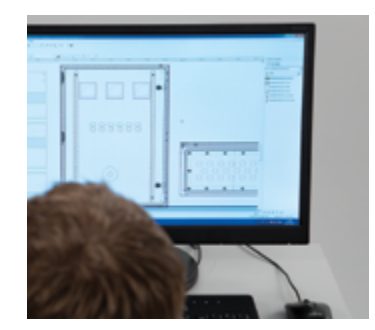
DXF or DWG-based software allows for easy drawing import or drag-and-drop drawing creation.