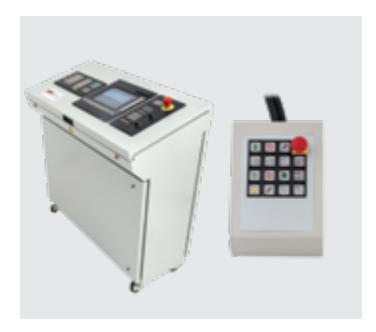
State-of-the-art controls from Beckhoff® or Siemens®