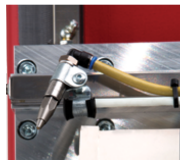
Minimal lubrication system extends tool life without creating a mess