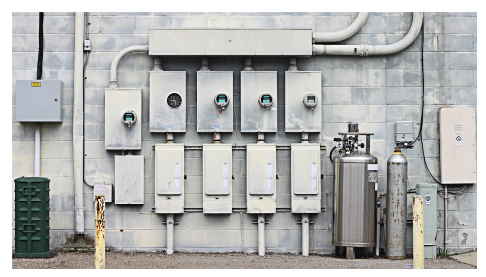
Enclosure solutions that perform reliably under punishing conditions existing in outdoor applications, such as UV radiation and temperature extremes, wind with blowing rain, snow, dust and dirt and salt spray in coastal regions.

The use of polyester, polycarbonate or hybrid polycarbonate/polyester blends for non-metallic enclosures provide new alternatives to fiberglass and stainless steel for corrosion resistance. These materials offer a wide range of performance characteristics and may prove to be a more cost-effective solution in some applications. Thermal plastic enclosures are molded by injecting the thermoplastic material into a mold, and the finished product is an attractive, uniform enclosure with a material that exhibits high impact resistance, electrical insulation