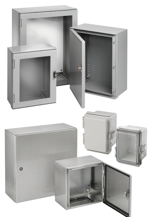
Designers must select the ideal metallic or non-metallic enclosure material for each individual solar application for the highest level of durability and longevity.

While solar power is an excellent source of energy, these applications are often located outdoors, exposing electrical enclosures, and the equipment within, to harsh environmental elements and demands. Whether for large, on-grid photovoltaics systems or concentrated solar power systems, designers want to implement electrical enclosure solutions that perform reliably, often under punishing conditions that exist in outdoor applications. These conditions can include UV radiation and temperature extremes, wind with blowing rain, snow, dust and dirt and salt spray in coastal regions.