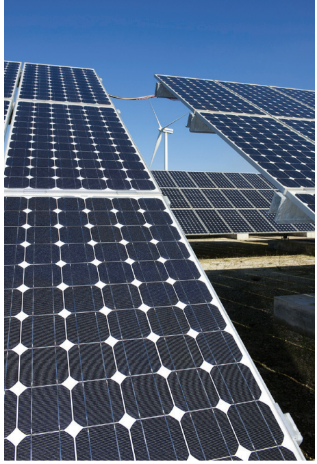
In order to ensure continued operation of critical electronic and networking equipment in solar applications, designers must select the ideal electrical enclosures that assist with solar thermal and tracking systems.

application will provide the intended protection and years of reliable service from the enclosure and equipment inside.