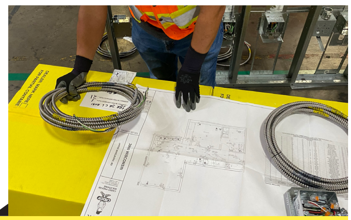
nVent CADDY CPS scales with projects by providing advanced prefabrication assemblies that are UL-listed, designed to strict specifications, and assembled in a controlled environment.

The Mona team appreciates how assemblies arrive palletized and in cartons clearly marked with the unit number or area type, making job site distribution much faster. Each assembly is assigned a number noted on the attached assembly list and unit drawing for quick reference. In addition, wall labels are included as well as all accessory items needed to complete the installation.